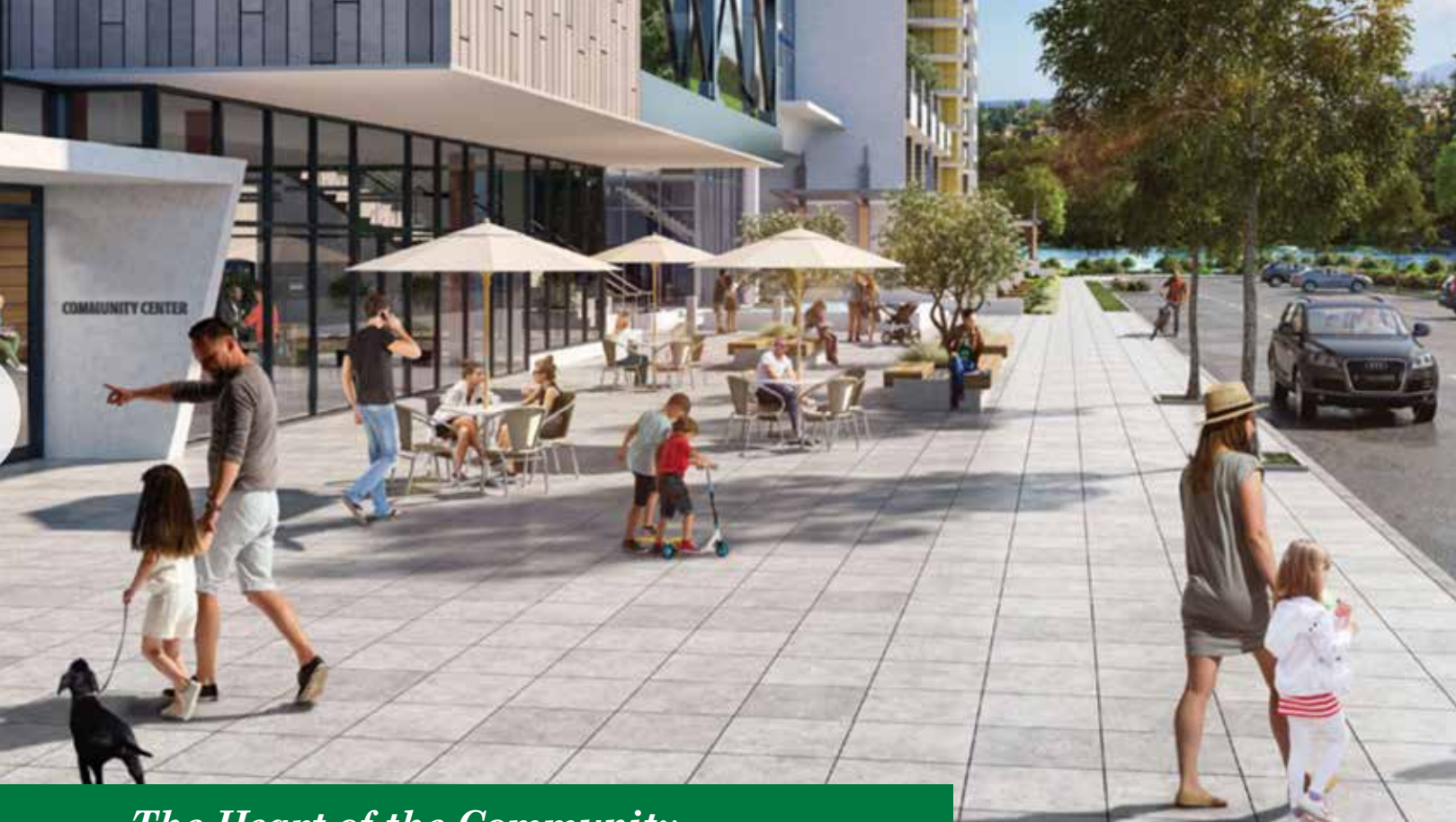
The Heart of the Community.